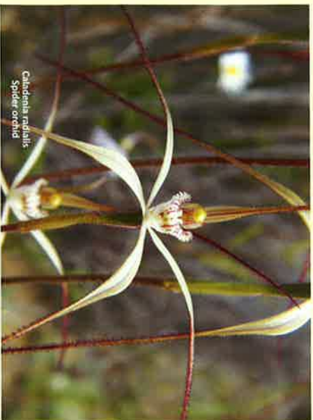
Caladenia radialis Spider orchid

From Kwolyin to: Kokerbin - 9 km Mt. Stirling - 21 km Caroline - 27 km Round trip via Gundaring Rock 59 km