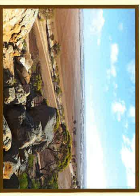
MT. STIRLING AND KOKERBIN ROCK